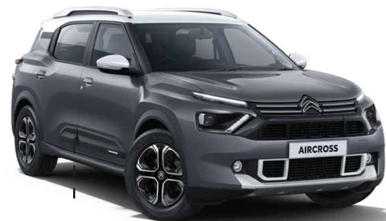
PLATINUM GREY BODY WITH POLAR WHITE ROOF