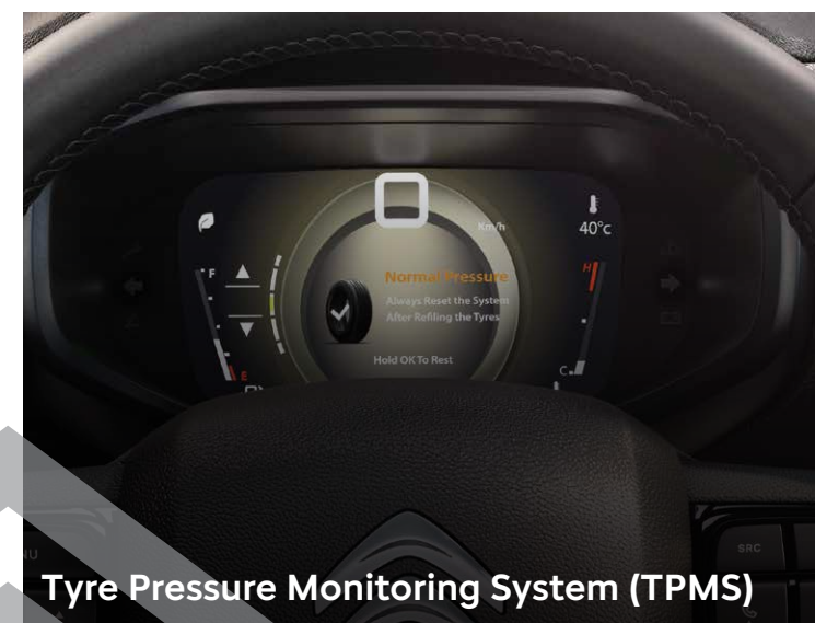
Tyre Pressure Monitoring System (TPMS)