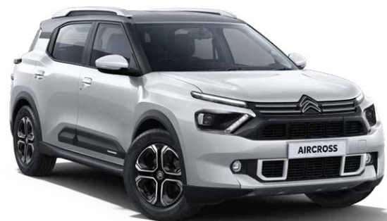
POLAR WHITE BODY WITH PLATINUM GREY ROOF