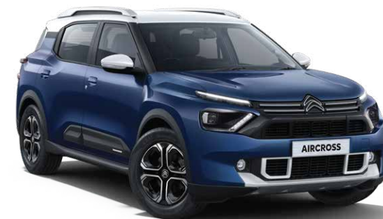
COSMO BLUE BODY WITH POLAR WHITE ROOF