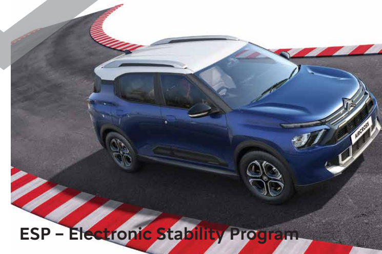
ESP – Electronic Stability Program

Equipped with 6 Airbags, front fog lamps, and day/night IRVM, the Citroën Aircross prioritises both safety and comfort. The ABS and ESP provide excellent traction, especially on slippery or loose terrain, making it ready for all kinds of journeys.