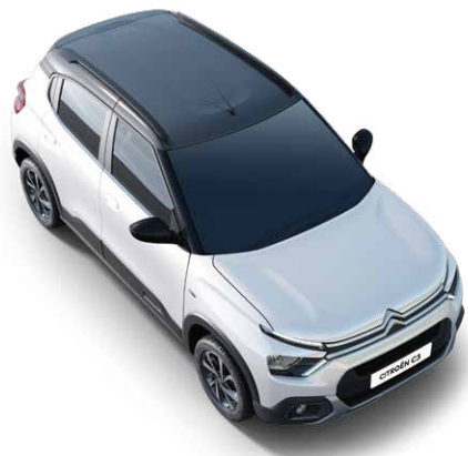
POLAR WHITE BODY WITH PLATINUM GREY ROOF