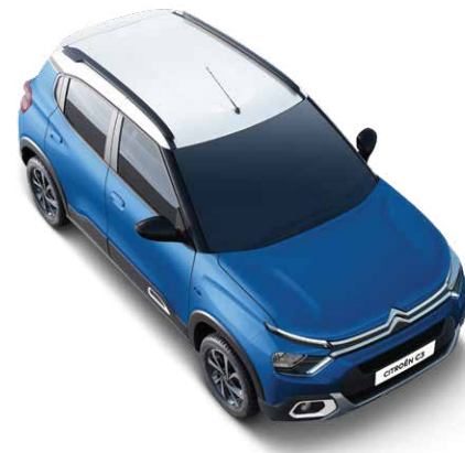
COSMO BLUE BODY WITH POLAR WHITE ROOF