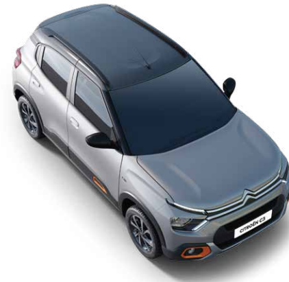
STEEL GREY BODY WITH PLATINUM GREY ROOF